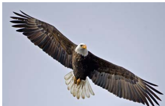
Photo 1: Adult bald eagle flying in a winter sky.

3 - Corresponding Author: Julie Beckstead ( beckstead@gonzaga.edu )