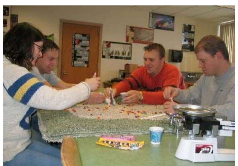
Students foraging on prey items on a table-top shag carpet environment.